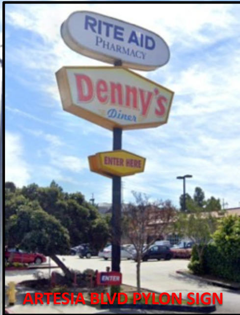
ARTESIA BLVD PYLON SIGN