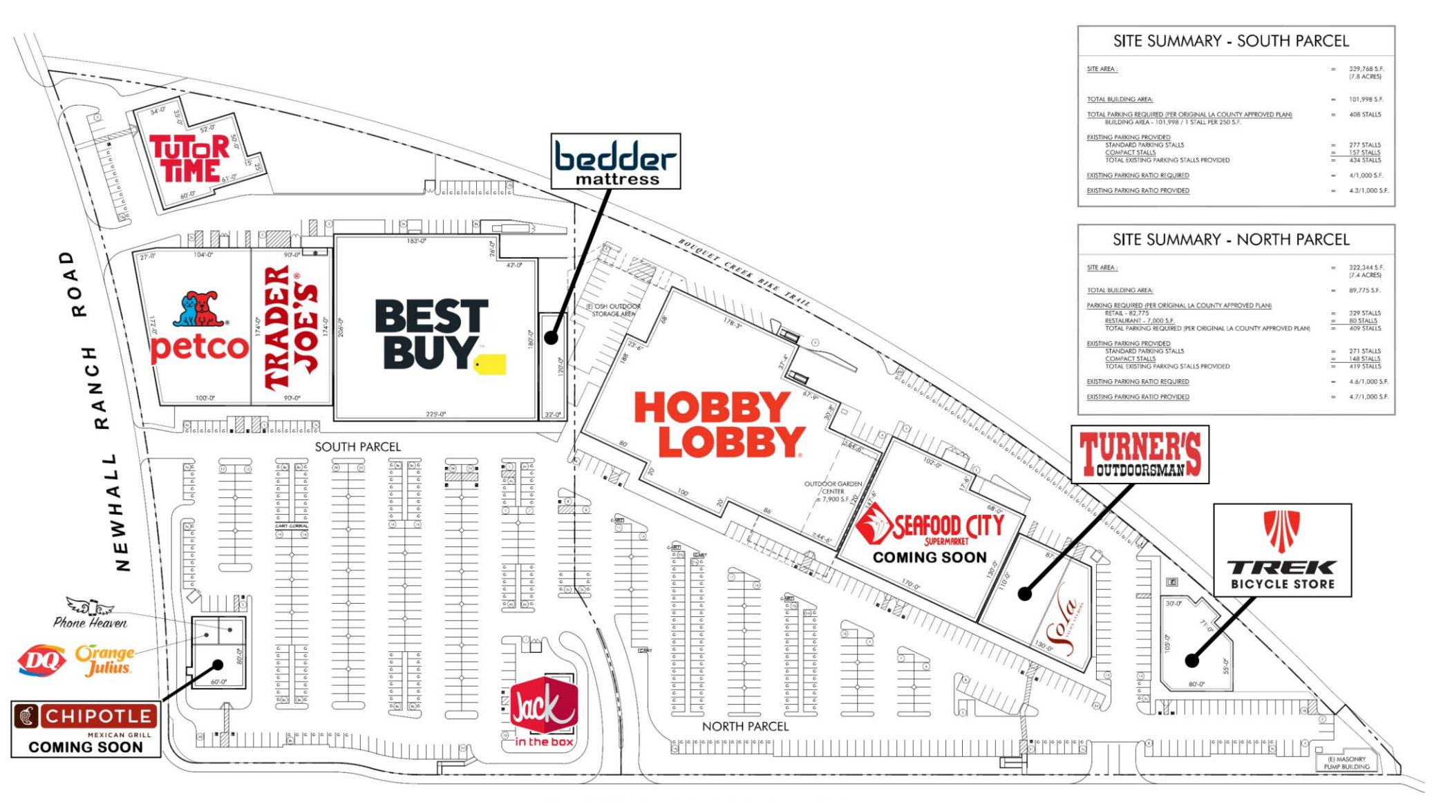
BOUQUET CANYON ROAD